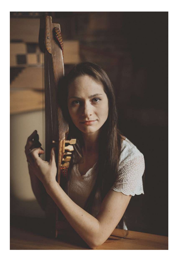
LVLR_13_Latvite Cirse