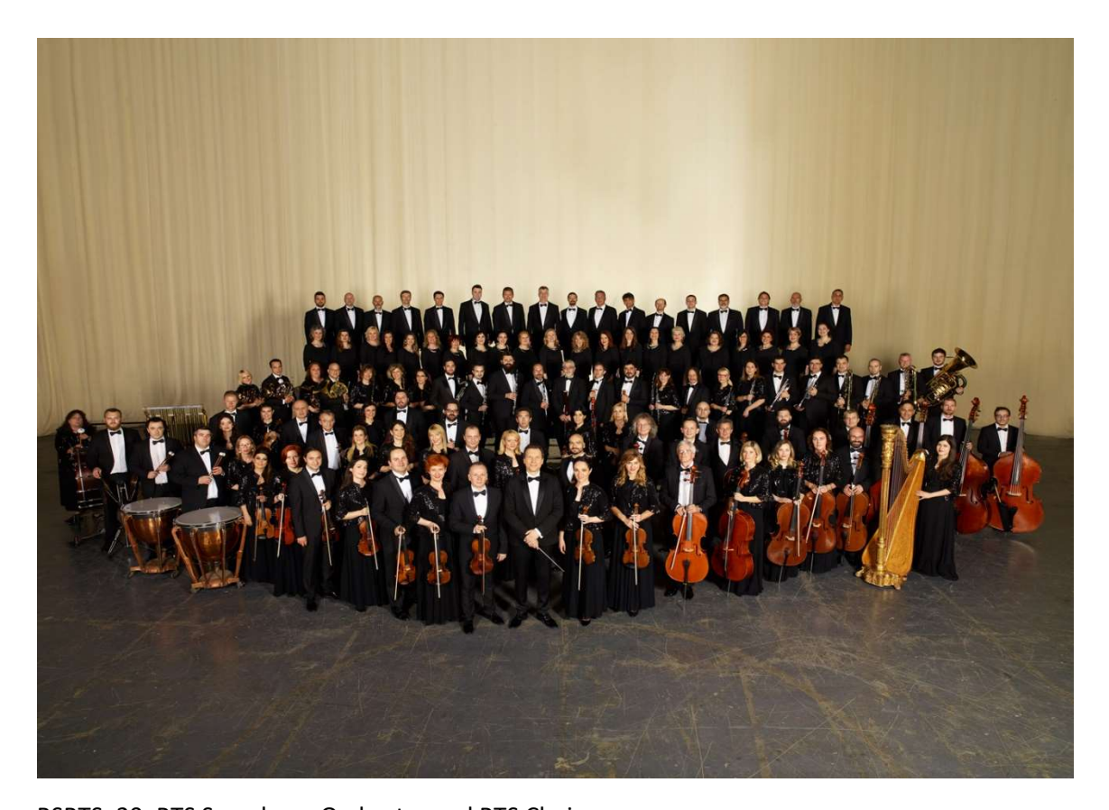
RSRTS_20_RTS Symphony Orchestra and RTS Choir

"Vranjska svita" is based on stylized melodies from Southern Serbia (around the city of Vranje). It consists of women's and men's songs and dances from that area, in which, in the musical sense, the permeation of Serbian folklore and oriental melodies can be recognized, which is characteristic of the music of this area. The suite ends with the attractive dance "Čoček", which is played by many peoples of the Balkans, and is also present in Serbian folklore.